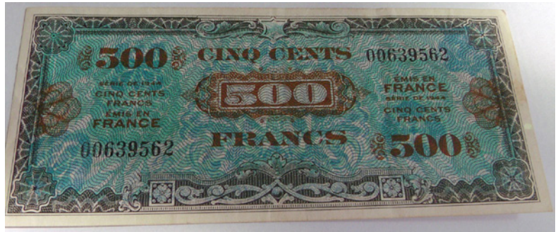
Smallest known number. For sale at €91 on ebay in April 2015.