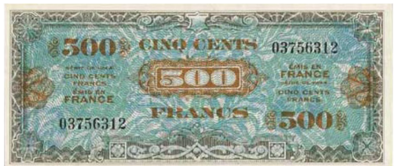
Copy in UNC grade sold £380 by Spink in 2010, sale of the Tom Warburton Collection (#1031)