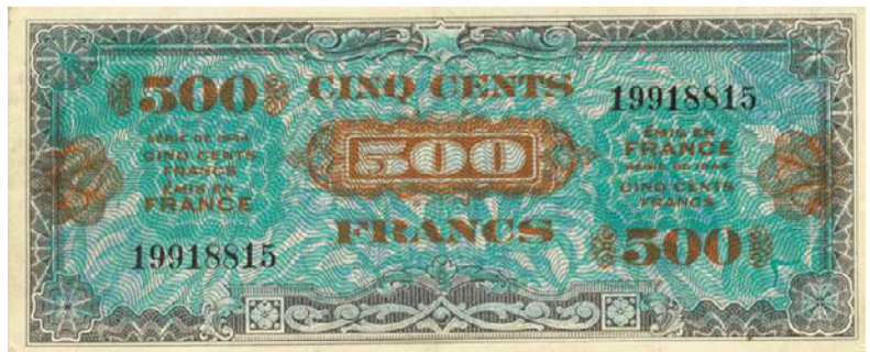
Largest known number. Seen on the website «multicollec.net» in September 2014.