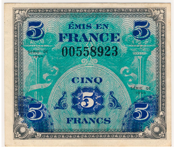
Ref: Fayette: VF17.1, Pick: 115a or Schwan-Boling: 143a